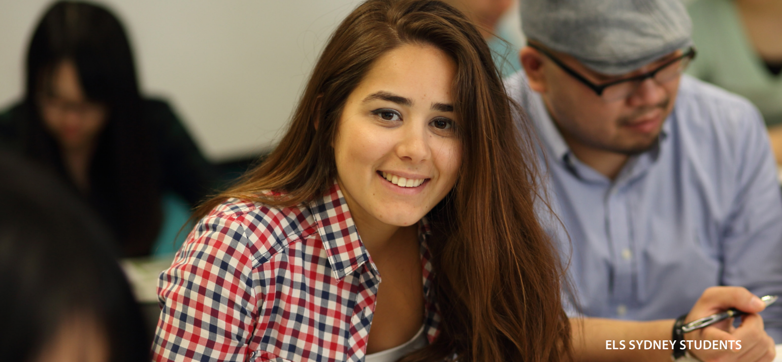
ELS SYDNEY STUDENTS