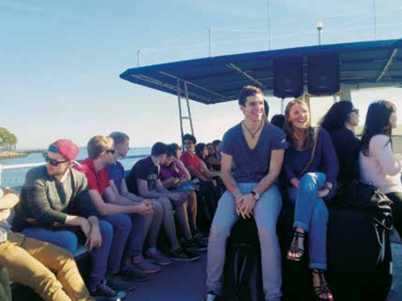
A tour of Long Beach Harbor