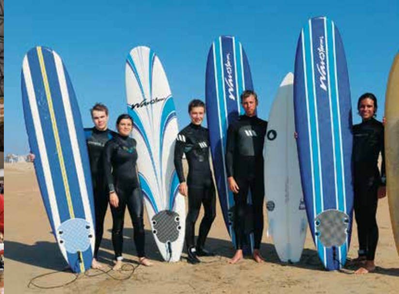
Surfing at local beaches