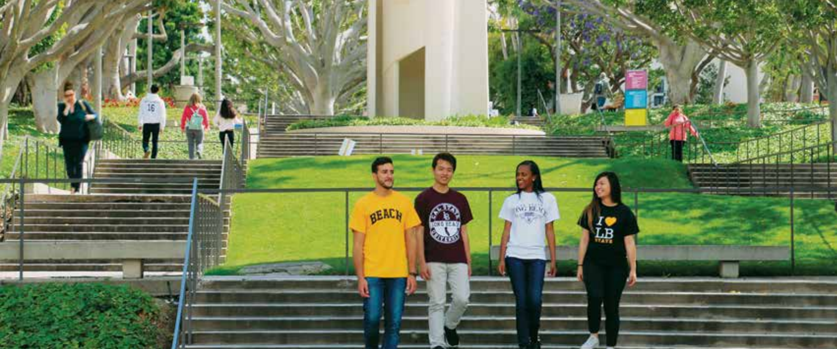
Students near the CSULB Bell Tower