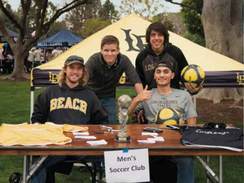
Week of Welcome