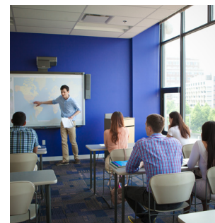
Classroom with SMART Board®