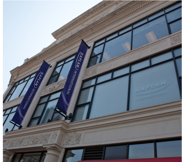
Exterior of Boston Fenway school

Please note that Kaplan International staff are not at the center on weekends. If you need immediate assistance, please call one of the emergency contact numbers.