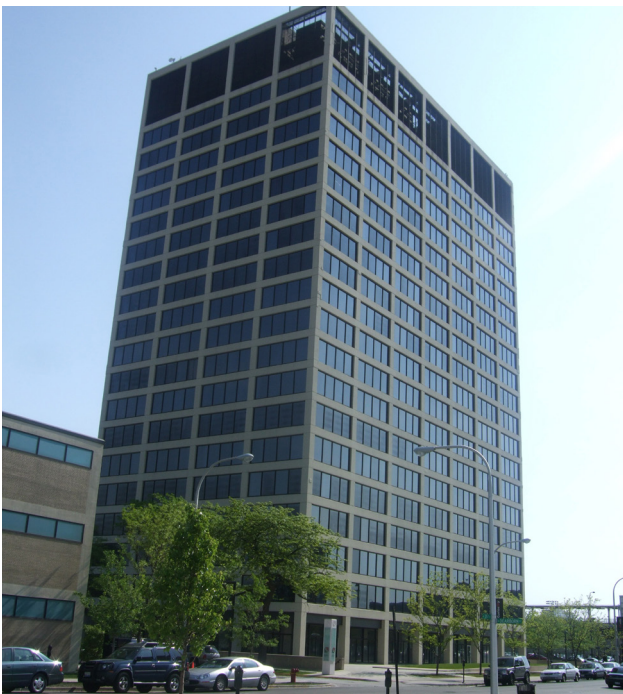
Illinois Institute of Technology Tower

With a comfortable feel of a university, while allowing students easy access to downtown Chicago, Kaplan IIT is only a 3-minute walk from USA Cellular Field, home to the Chicago White Sox. Chicago is full of world class museums like the Field Museum, and the Museum of Science and Industry – both close to the school. The city is world renowned for its amazing architecture, which you can see on the Architecture Boat Cruise, or from the top of Sears Tower.