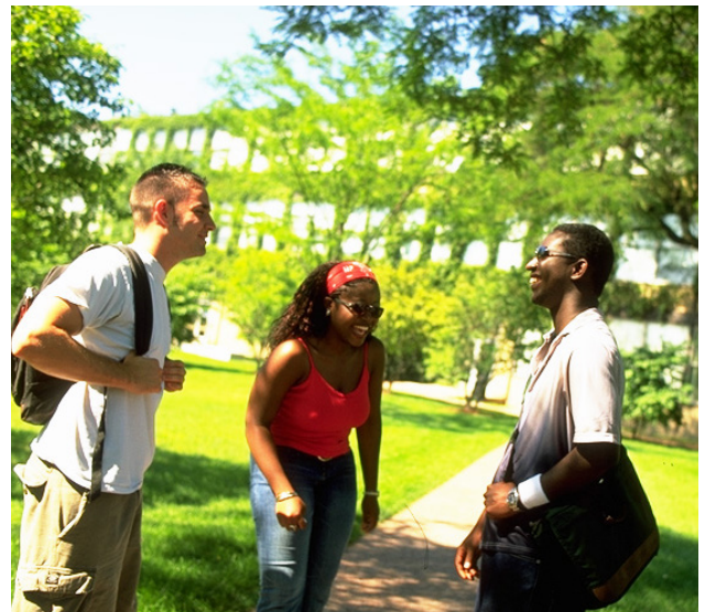
Kaplan Students at Illinois institute of Technology