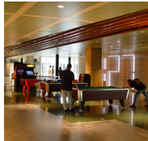
One of the campus common rooms