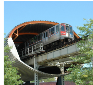
Sky train at the campus