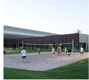
Beach volleyball court on campus