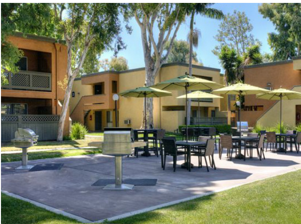
Residence grounds exterior view

At Kapi Apartments, students will have the chance to meet and make new friends with other international learners from all over the globe. This will be a great occasion to explore and learn about new cultures while perking up their English language skills.