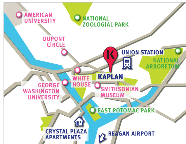
Location of Kaplan Washington, DC school and Crystal Plaza Apartments

Crystal Plaza Apartments 2111 Jefferson Davis Hwy Arlington, VA 22202 USA