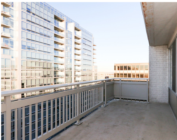
Balcony view from a Crystal Plaza Apartment

Crystal Plaza Apartments have direct access to the Crystal City Metro and Crystal City Shops, which offers a variety of shops, delis and award winning restaurants. Kaplan International is approximately 20-25 minutes by Metro.