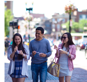
Harvard Square Students