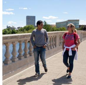
Harvard Square Students

Kaplan International provides students with wireless internet and nearby cafés and bookstores also have wireless internet capability.