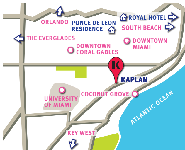
Location of Ponce De Leon Hotel and Kaplan Miami school

Ponce De Leon Hotel 1721 Ponce De Leon Blvd. Coral Gables FL 33134