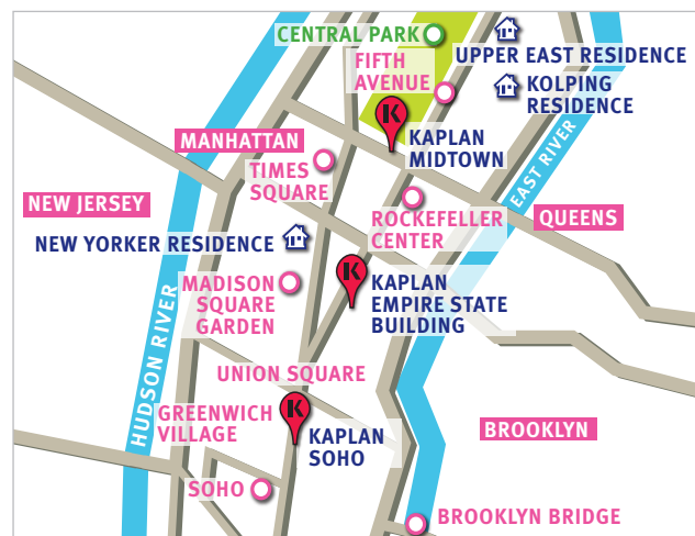
Location of The New Yorker Residence and Kaplan International schools in New York

The New Yorker 481 Eighth Avenue (at 34th St.) New York NY 10001