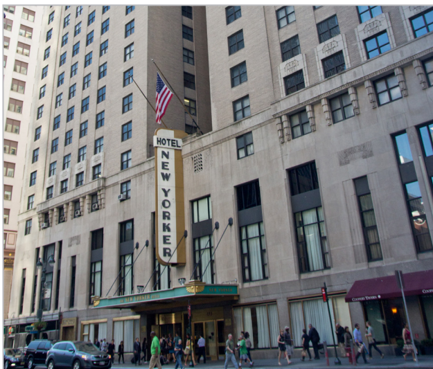
The New Yorker

The New Yorker offers students well located accommodation with excellent amenities including 24-hour security, gym, air conditioning and free domestic phone calls!