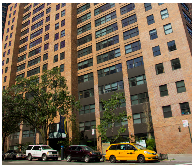
Upper East exterior view

This state of the art building features quality amenities including a media/multi-purpose room, a fully equipped 3,500 sq. ft. fitness center, games room, and lounges for studying and socializing.