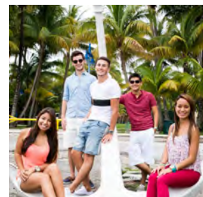
Students exploring the city