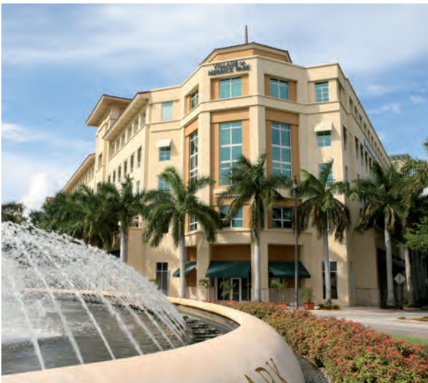
Kaplan International Miami

There's so much going on in Miami, you'll need an extra hour in the day to enjoy everything that makes this city so vibrant. Whether you are an arts enthusiast, food lover, shopaholic, socialite or sun worshipper, this elite playground promises plenty of options to fill 25 hours per day - if only you had that extra hour!