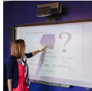
Classroom with SMART Board®