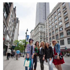
Students exploring NYC