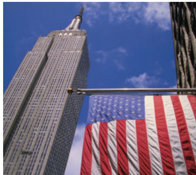
Kaplan International New York Empire State Building