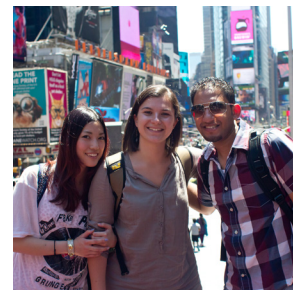
New York Times Square