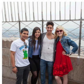
View from the roof top of the Empire State building

There are many mobile phone providers that can provide long-term or short-term plans to suit your needs. There is free wifi at the school during regular hours and from many local businesses in the area.