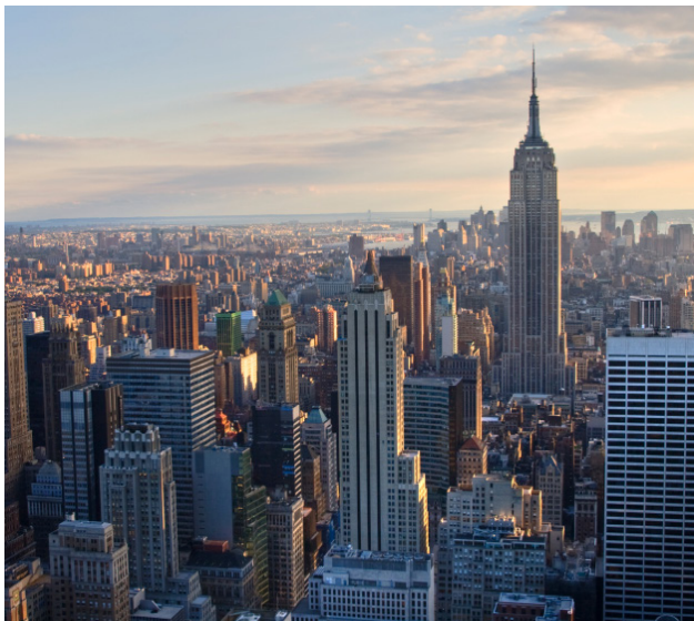
New York skyline

Our Empire State Building center towers above the city on the 63rd floor of this landmark building. Built in the 1930s, the Empire State Building is a part of both New York and US history and today still attracts visitors from around the world. The Empire State Building is just steps away from Macy's at Herald Square and the world's most famous arena, Madison Square Garden. There is access to major subway lines taking you to your accommodation, and every place in the city you'll want to visit.