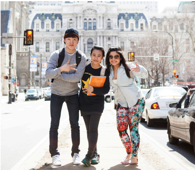
Kaplan International students exploring Philadelphia

Philadelphia is a diverse city, rich in American heritage and the Arts. Independence Hall and the Liberty Bell are just a few examples of the wonders Philadelphia has to offer students. Boutiques, museums, restaurants, and the diverse culture create a feeling that Philadelphia is home to anyone who visits. Philadelphia is the home of over ten highly competitive universities including the University of Pennsylvania.