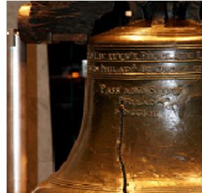
The famous Liberty Bell

There are many cafes and coffee shops in the neighborhood that offer free wifi Internet access.