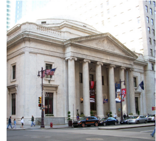
Philadelphia Ritz Carlton