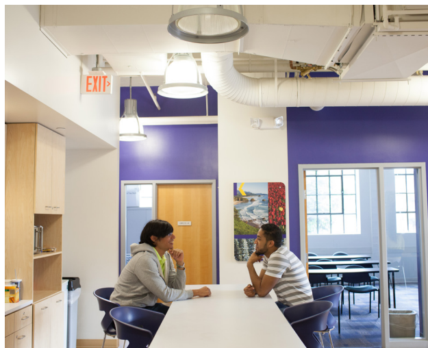
Kaplan Portland school

To get to the Kaplan International Portland from the airport, take the MAX Red Line to City Center and Beaverton TC. Get off at the Galleria/ Library MAX station. Take the street car North for 3 stops and get off at NW 10th and Everett. Walk West to NW 13th Street and Everett. Our building is at 323 NW 13th Ave. Enter the building and take the elevator to the 3rd floor.