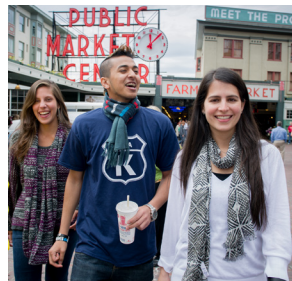
Strolling around Pike Place Market