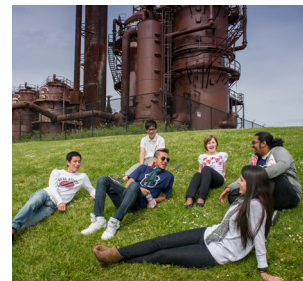
Relaxing at Gas Works Park