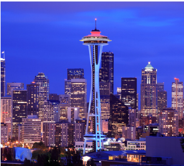
Seattle at night

Aside from great social activities for everyone, Seattle is a magnet for new start-up companies. It is home to some of the largest and most high-tech companies in the world, like Microsoft, Amazon, Boeing, Starbucks, and T-Mobile. All are open for tours.