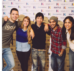
Kaplan students on campus

There are many shopping opportunities in the downtown area.