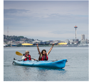
Kayaking Lake Union