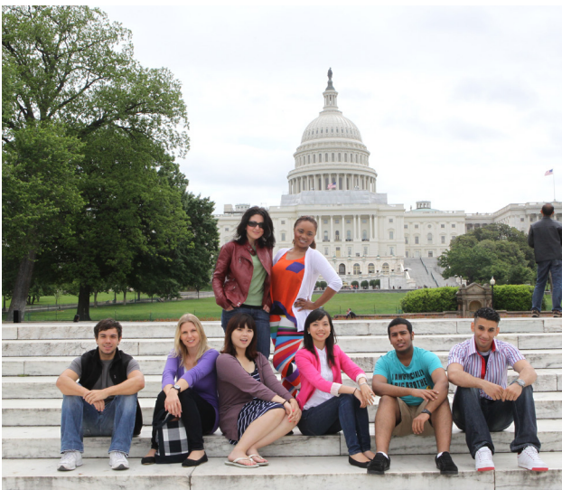
Kaplan students exploring Washington D.C.

The Washington, DC Kaplan International school offers first-class modern facilities with an extensive library of self-study material to be used at the center. The self-study material includes access to the school's dedicated English computer lab with language software, internet and WiFi, and a wide variety of practice language activities which can be developed into individual study plans.