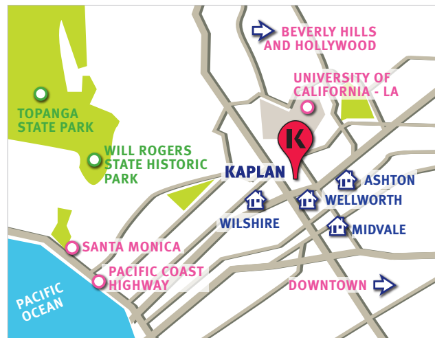
Location of Kaplan International Westwood and Westwood Apartments