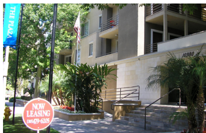
A typical apartment building