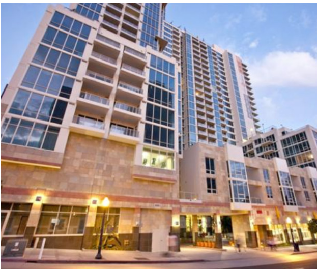
Exterior view of Vantage Pointe Apartments

The apartments feature two large bedrooms, a living room, a modern kitchen and two bathrooms. Students can choose between single or twin rooms and each apartment sleeps a maximum of 4 students.