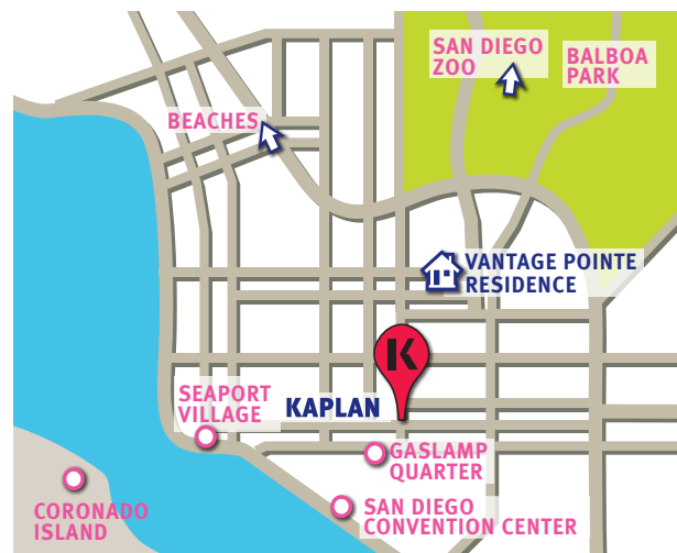
Location of San Diego's Kaplan school and Vantage Pointe Apartments

Vantage Pointe Apartments 1281 9th Avenue San Diego, CA 92101