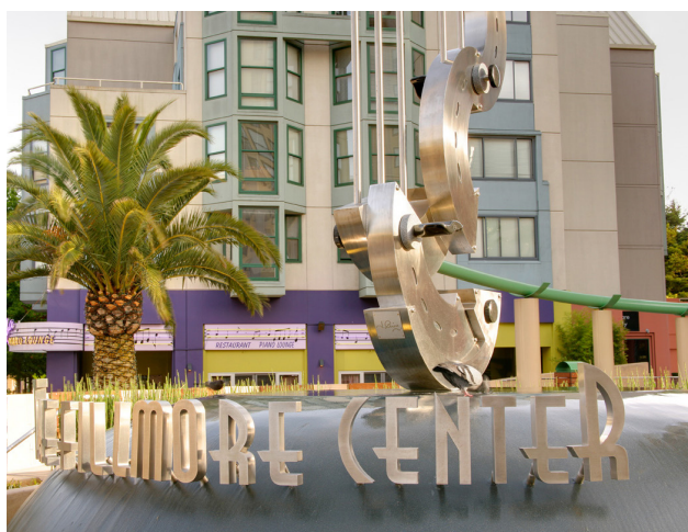
Rexidence Fillmore Center

Spacious 2 bedroom / 2 bathroom apartments have fully equipped kitchens, and a separate living room/dining room area. Each apartment has a dining table, flat screen television with cable, and free high speed wireless internet. Residents have access to laundry on designated floors, large communal grounds, including barbecue areas, and they can also use the free shuttle bus into downtown. There is a full service fitness center with swimming pool within the complex, for which residents receive discounted membership rates.