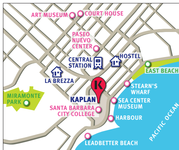
Location of Kaplan Santa Barbara and La Brezza Apartments

620 West Gutierrez Street Santa Barbara CA 93101