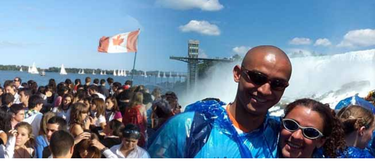
Optional Tours: Spice up your activity calendar with exciting 2, 3 or 4 day fully escorted trips to: